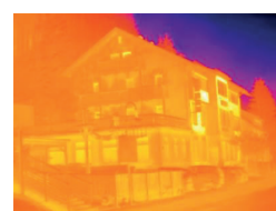
Thermal image without ScaleAssist

Since the temperature scale and colouring of thermal images can be adapted individually, it is possible that the thermal behaviour of a building, for example, can be wrongly interpreted. The testo ScaleAssist function solves this problem by adjusting the colour distribution of the scale to the interior and exterior temperature of the measurement object and the difference between them. This ensures objectively comparable and error-free thermal images.