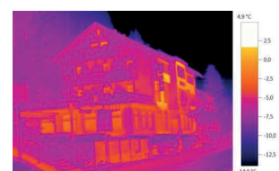
Thermal image with ScaleAssist