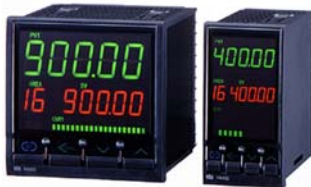
HA430/930 melt-pressure controllers