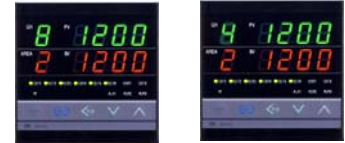
MA900/901 4/8 zone controllers