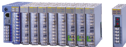
SR Mini extruder control systems