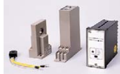
HBA series heater break alarms