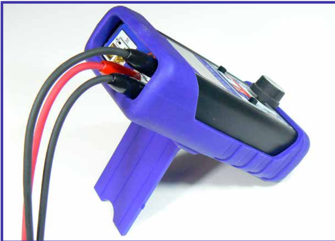
Flip out stand for bench use